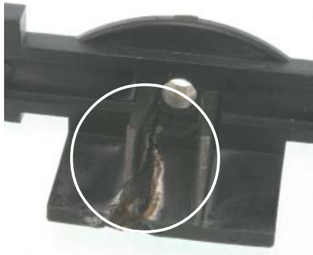
Unacceptable (Developing bearing bar failure)